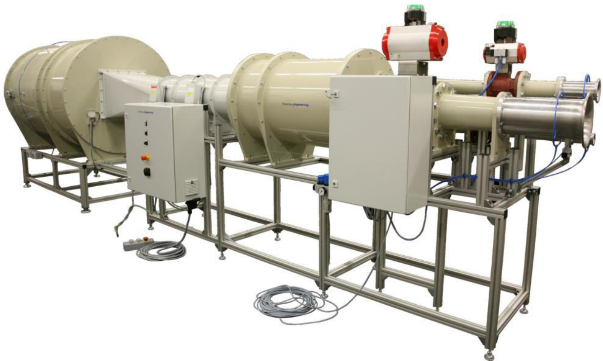
Fig. 1 Volume flow test bench